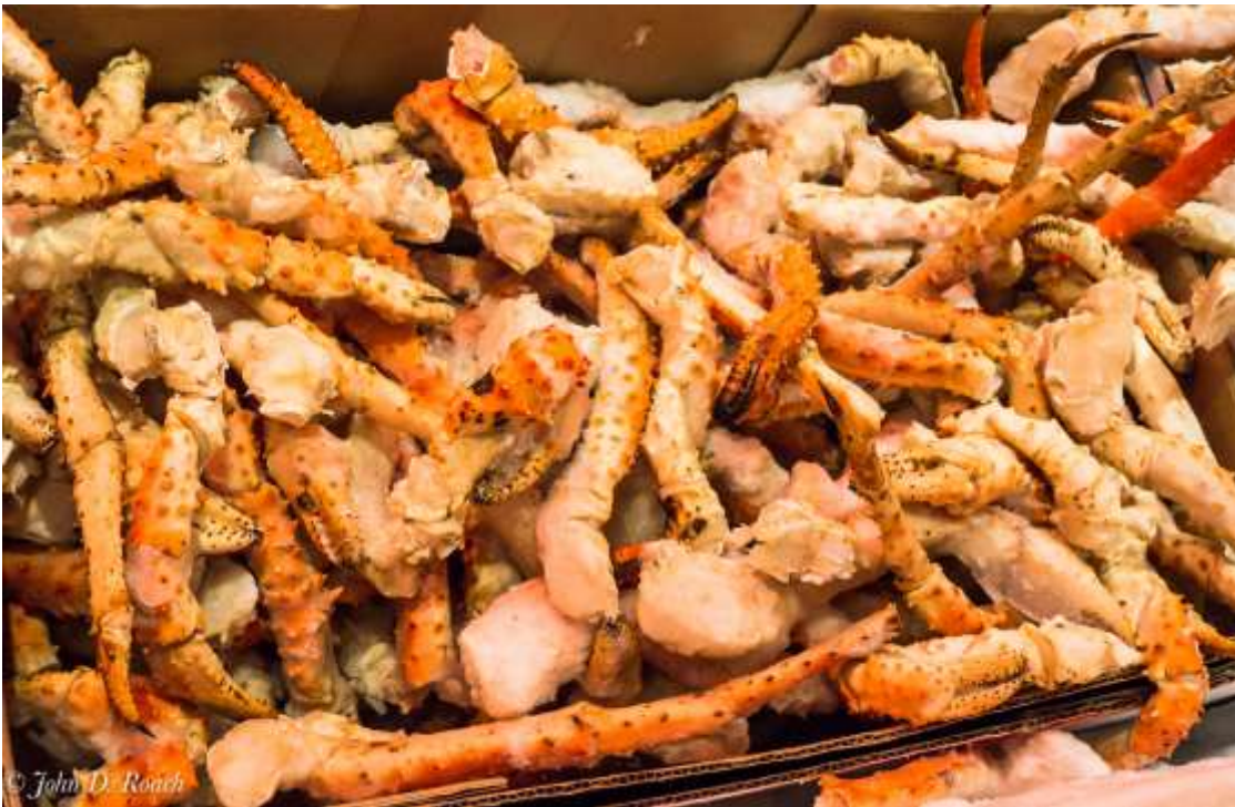
Crab Legs at St. Paul's Fish Market