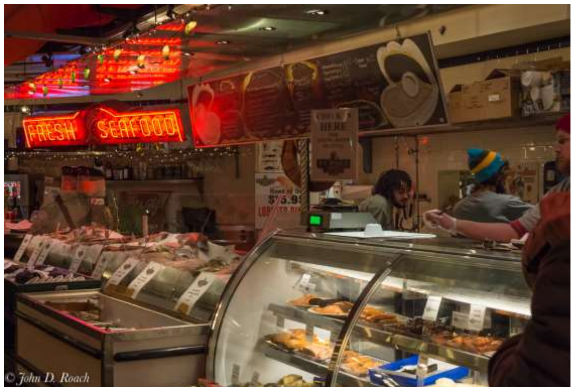
Fresh Seafood at St. Paul's Fish Market