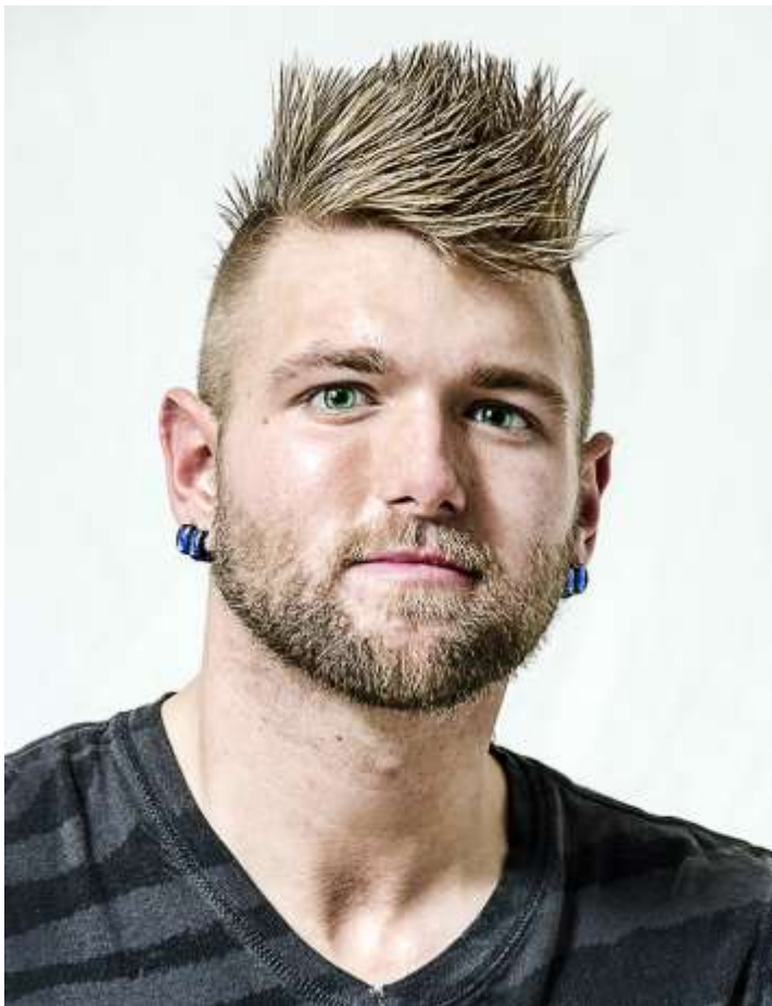
Travis by Gary Peel won second place in our photo challenge.