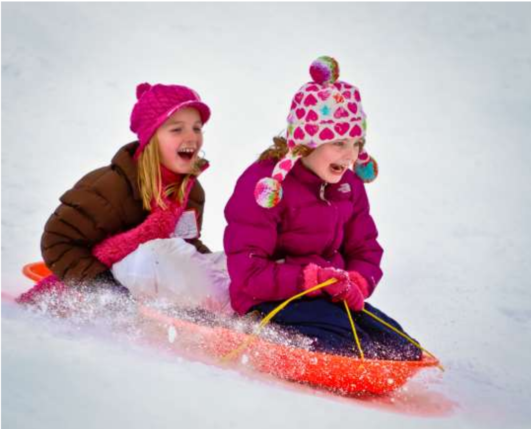
Sledding by Phil Waitkus won second place in our photo challenge.