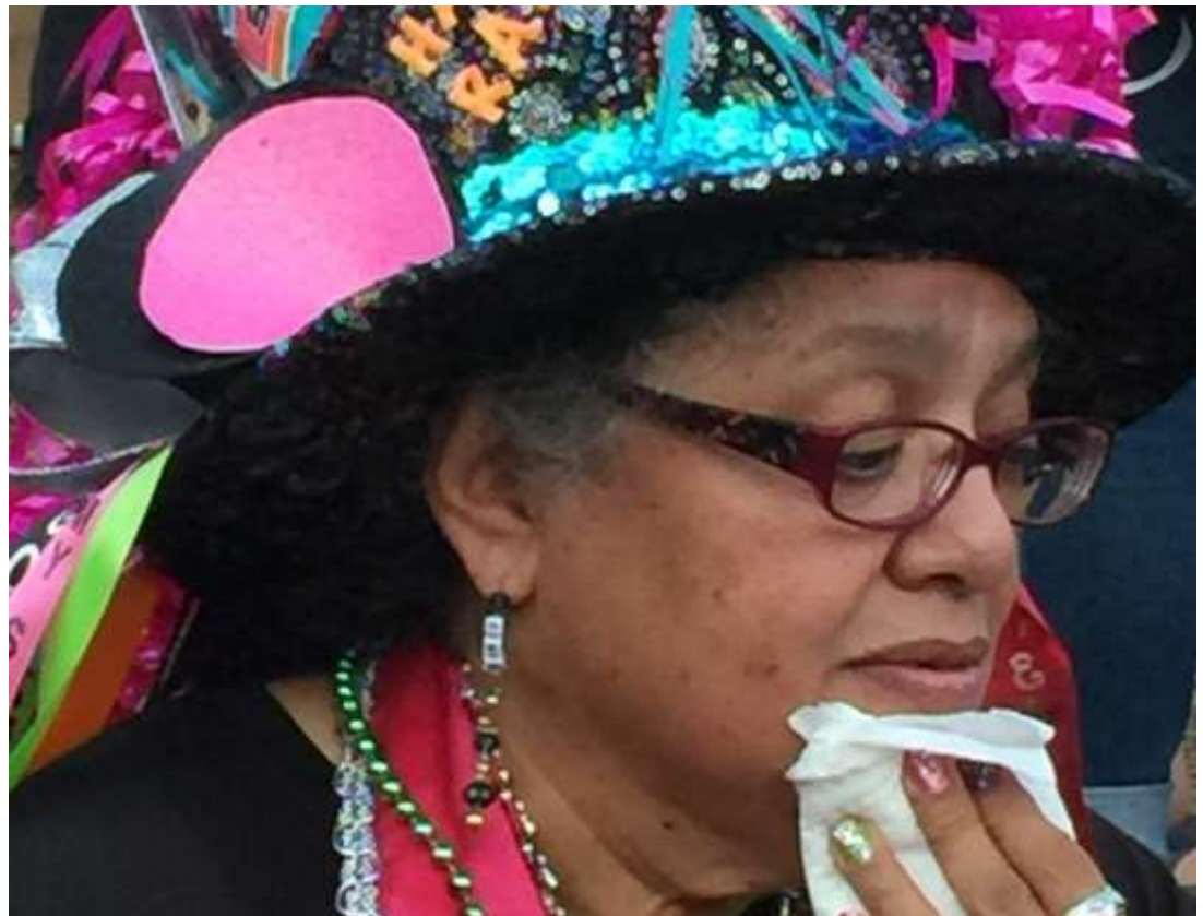
Fiesta Lady by Phyllis Bankier.