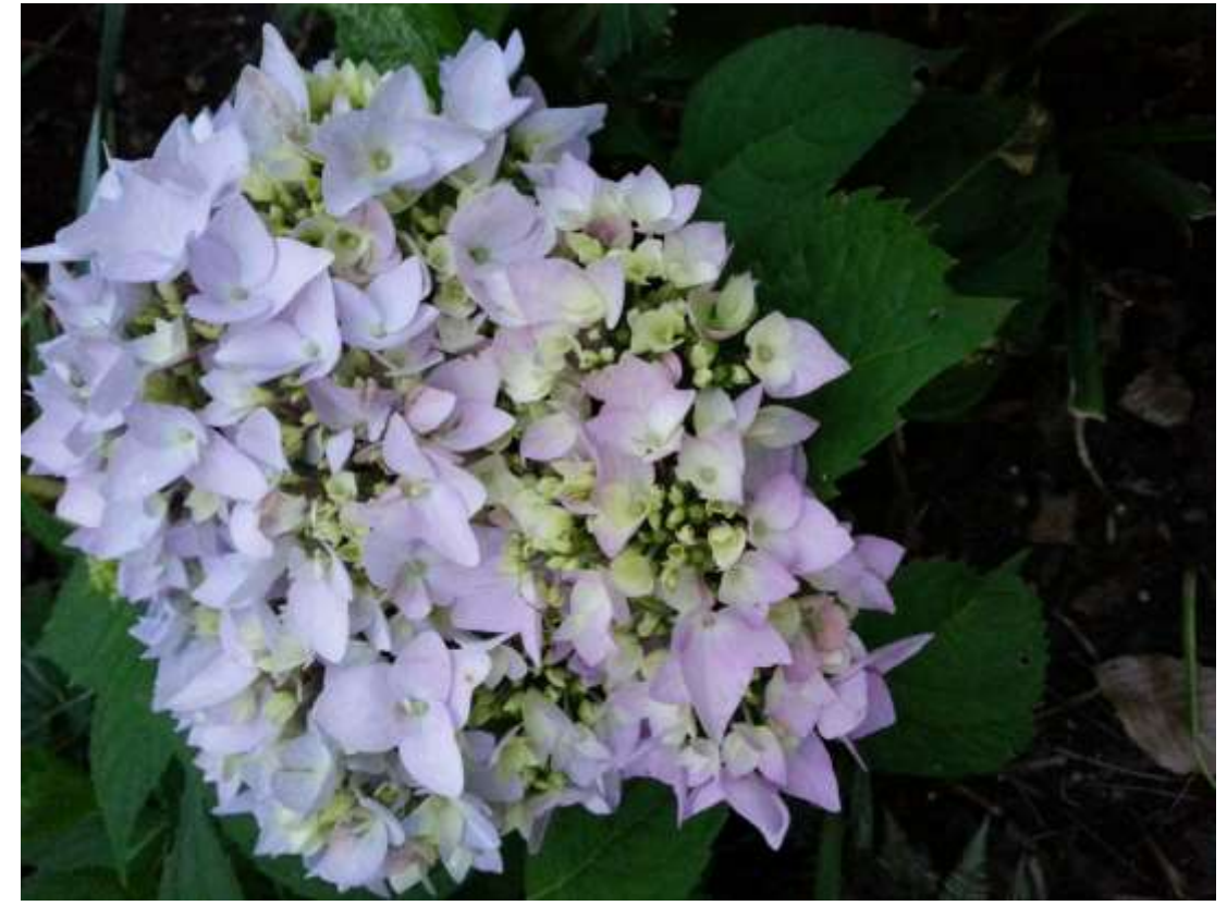
Enchantress Hydrangea by Carole Kincaid