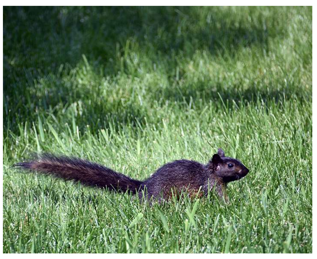
Black Brown Squirrel