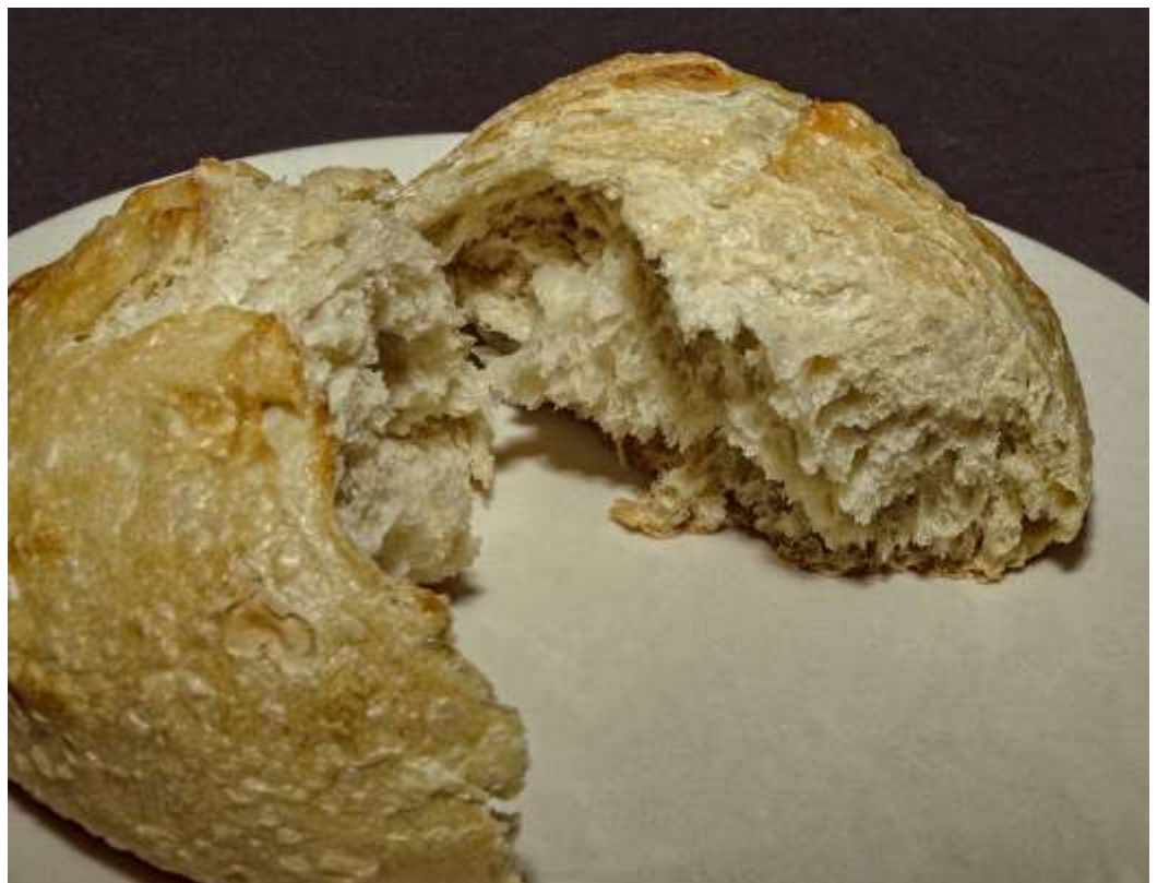
Broken Bread, by Gary Peel