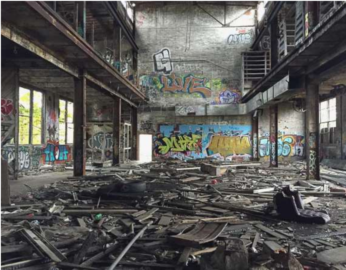
Abandoned Building , one of our third place images was by Ted Tousman