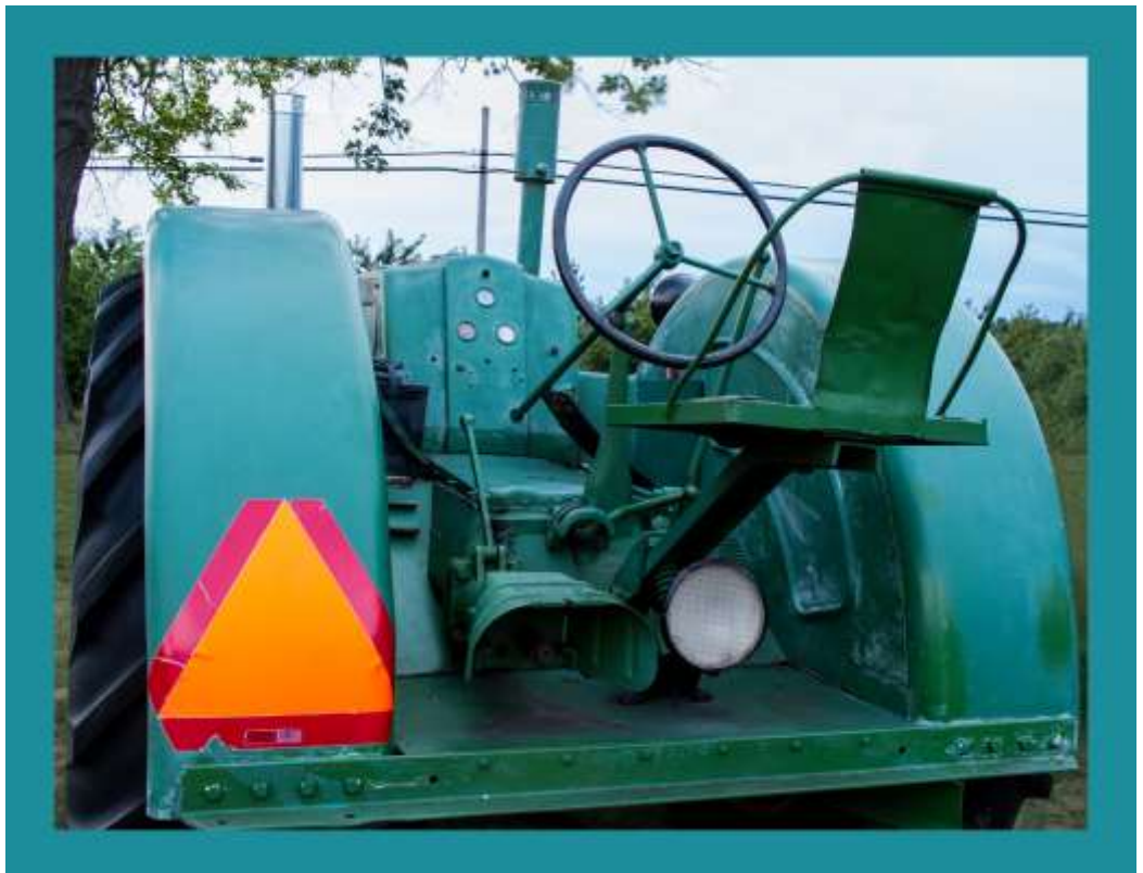
by Phil Waitkus