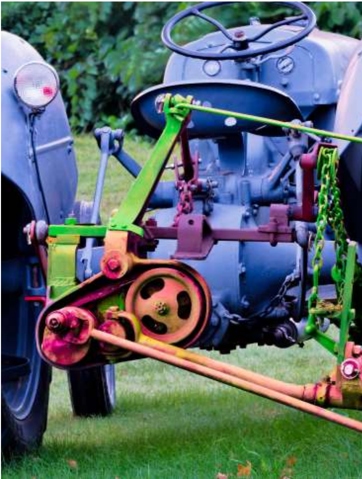
Tractor S Fin