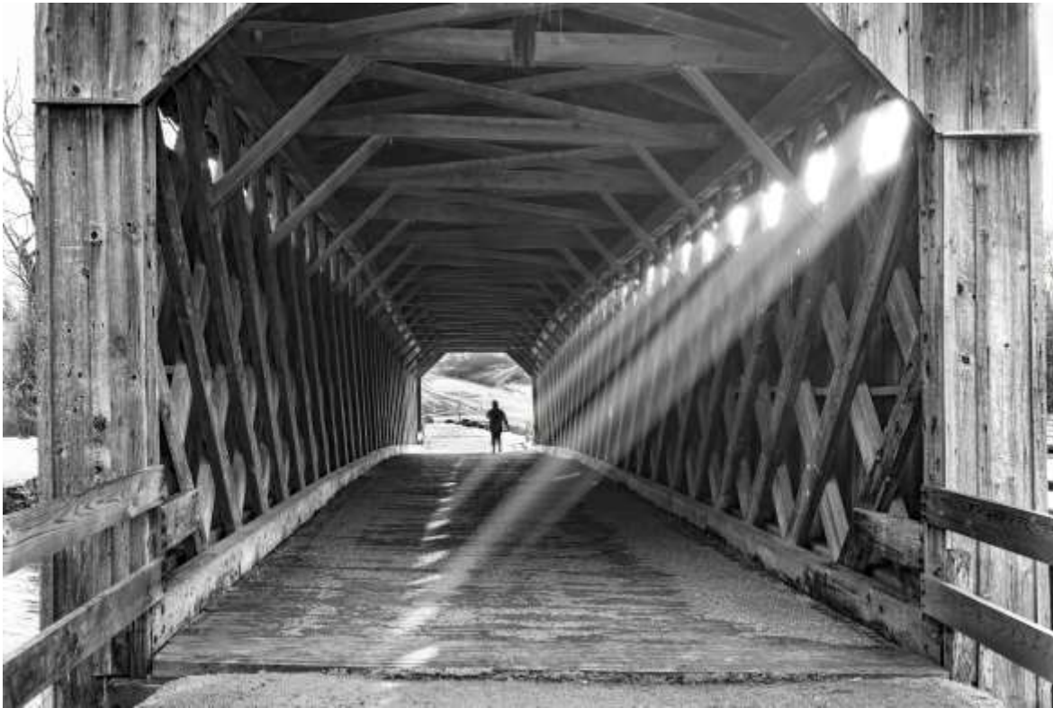
Covered Bridge by Joseph Eichers, in the Open category.