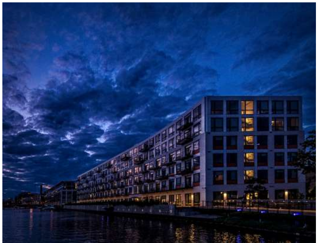
Night by Gary Peel, in the Urbanscape category.