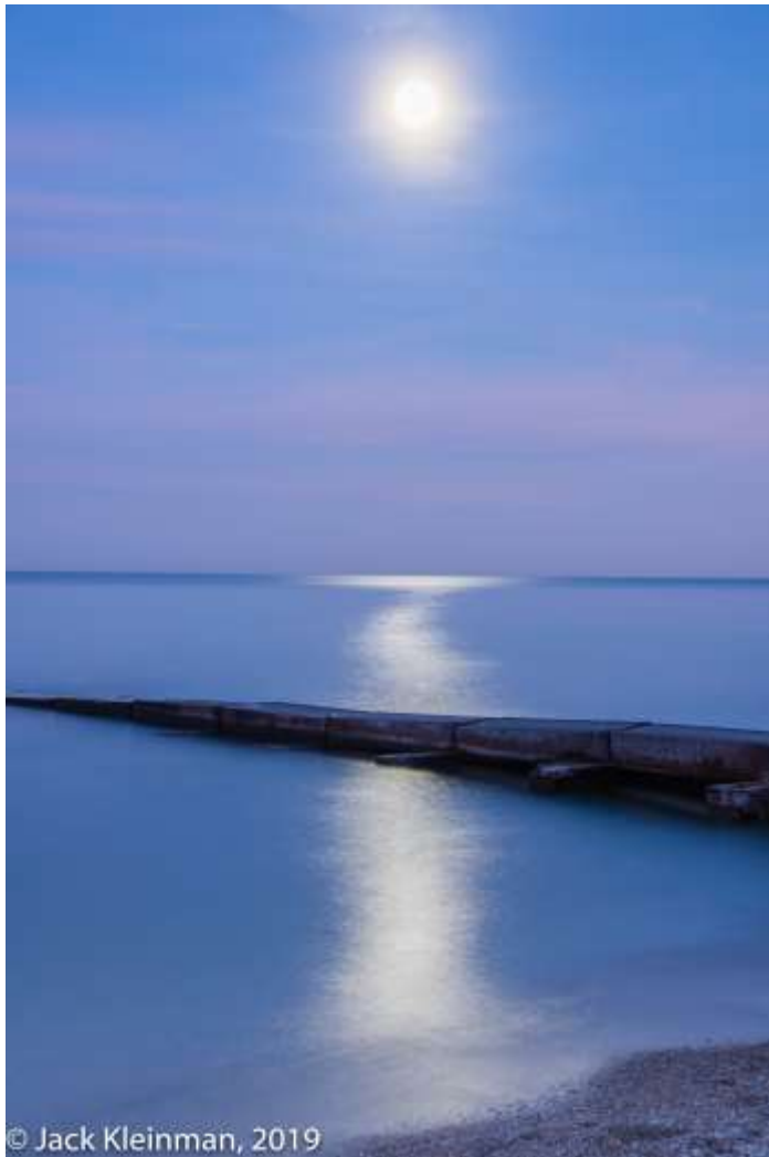
Big Bay Park Shoreline at Blue Hour by Jack Kleinman was our second place winner.