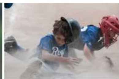
Photo Challenges 2019: