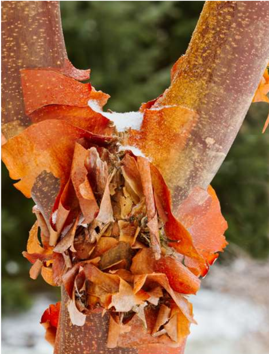
Winter Yellow Birch by Phillip Waitkus , first place in our February Photo Challenge: Part of a Winter Tree