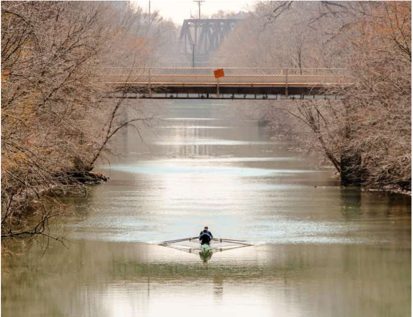
Peaceful Morning Row by Marci Konopa , first place in our January Photo Challenge: Down by the River