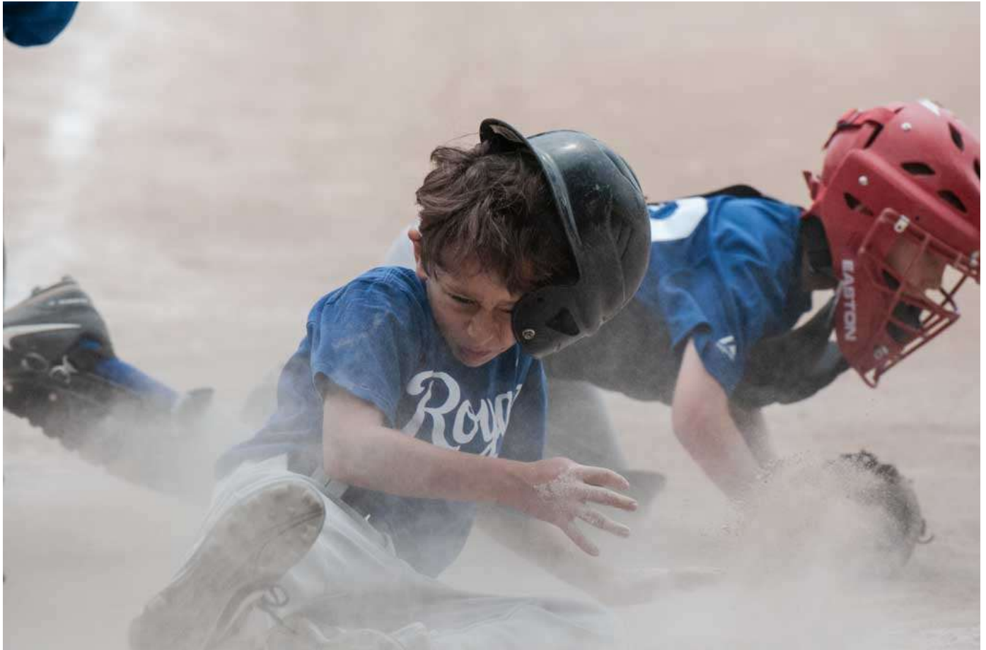
Path through the Dust by Ted Tousman , first place in our November Photo Challenge: Sports Stop Action