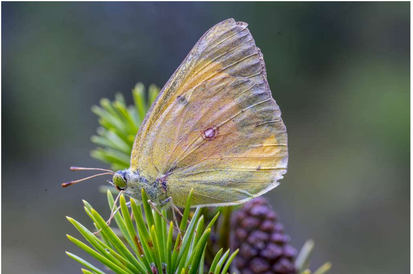
Morning Visitor by Diana Duffey , first place in our September Photo Challenge: Insects