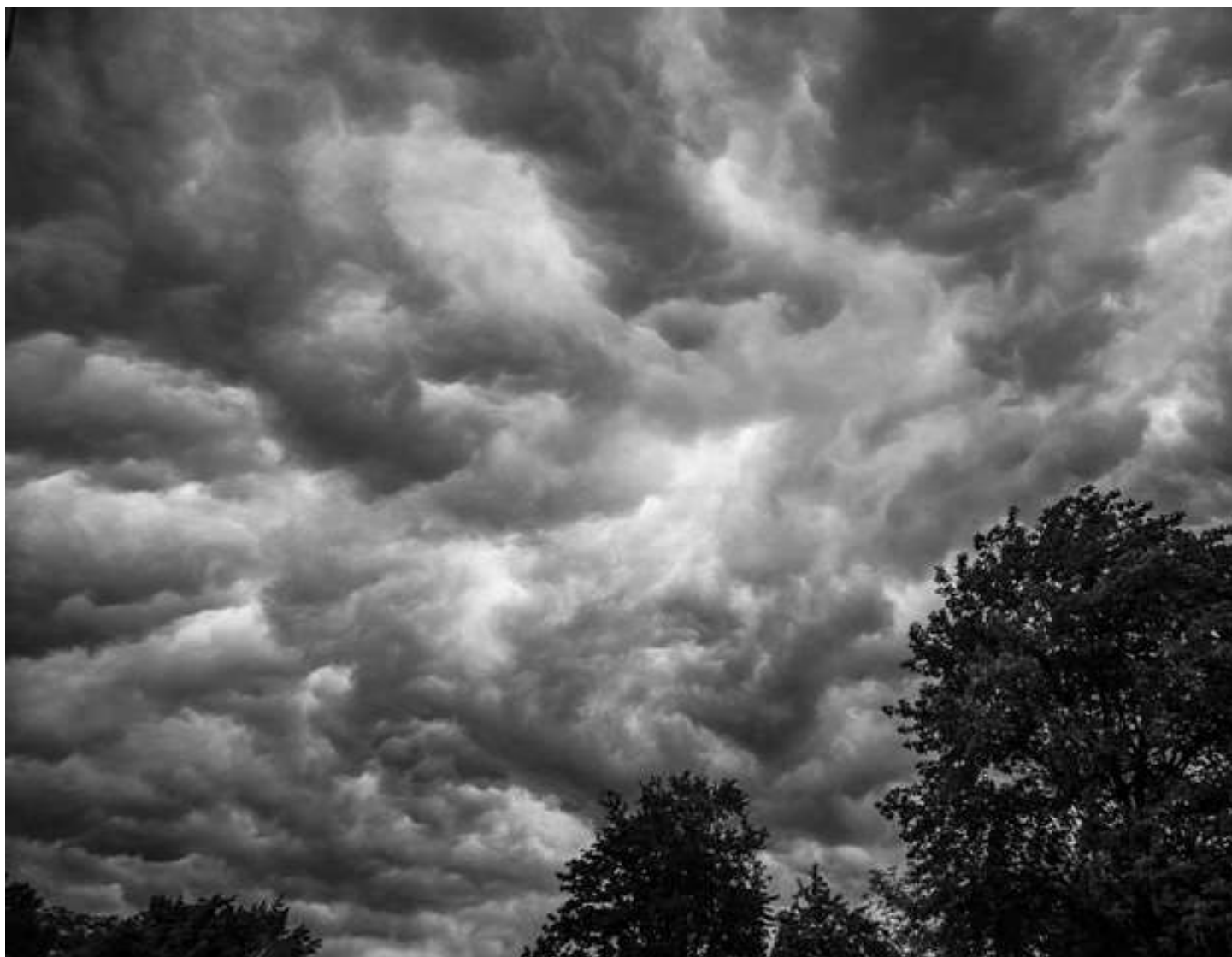
Storm Clouds by Diane Rychlinski , first place in our March Photo Challenge: Clouds