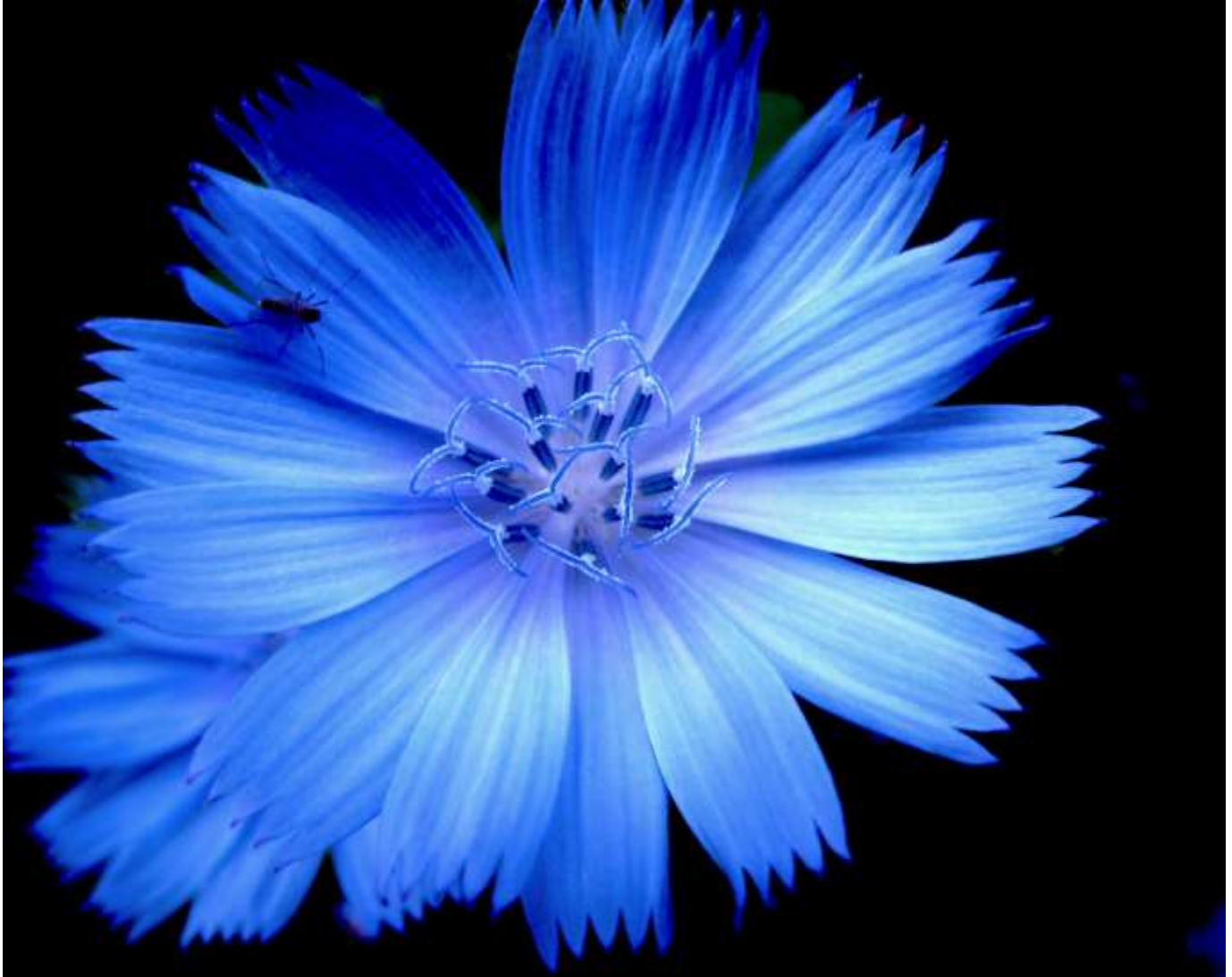
Enjoying the Blues by Ann Matousek , first place in our April Photo Challenge: The Color Blue